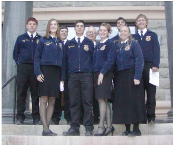
Pictured above, Hohne FFA members give speeches fighting against the Pinon Canyon Expansion.

The Hoehne FFA has taken a successful and critical role in its community. Our chapter has been very involved in the opposition of the Pinon Canyon expansion. Our members have taken a role to stop this action and to save our community. Recently, members attended a hearing from U.S. Senator John Salazar and from Congressman Mark Udall. Members from the Hoehne FFA chapter shared their feelings about the expansion to the congressmen. Also, members attended a meeting in Trinidad to oppose a striker brigade that would help in the expansion of Pinon Canyon. FFA members have also given speeches to the community to oppose the brigade.