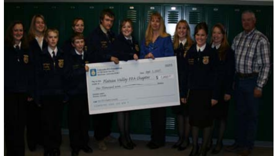
Pictured above is the Plateau Valley FFA Officer team with State FFA Officers and FFA Foundation Repre-

In addition our chapter is developing CDE teams and educating members about official dress. It may be a lot of work, but this year's officer team is determined in making a strong chapter. The support of our local community has been incredible. At the November Chapter Meeting, the chapter proudly accepted a donation for FFA supplies from the Colorado FFA Foundation.