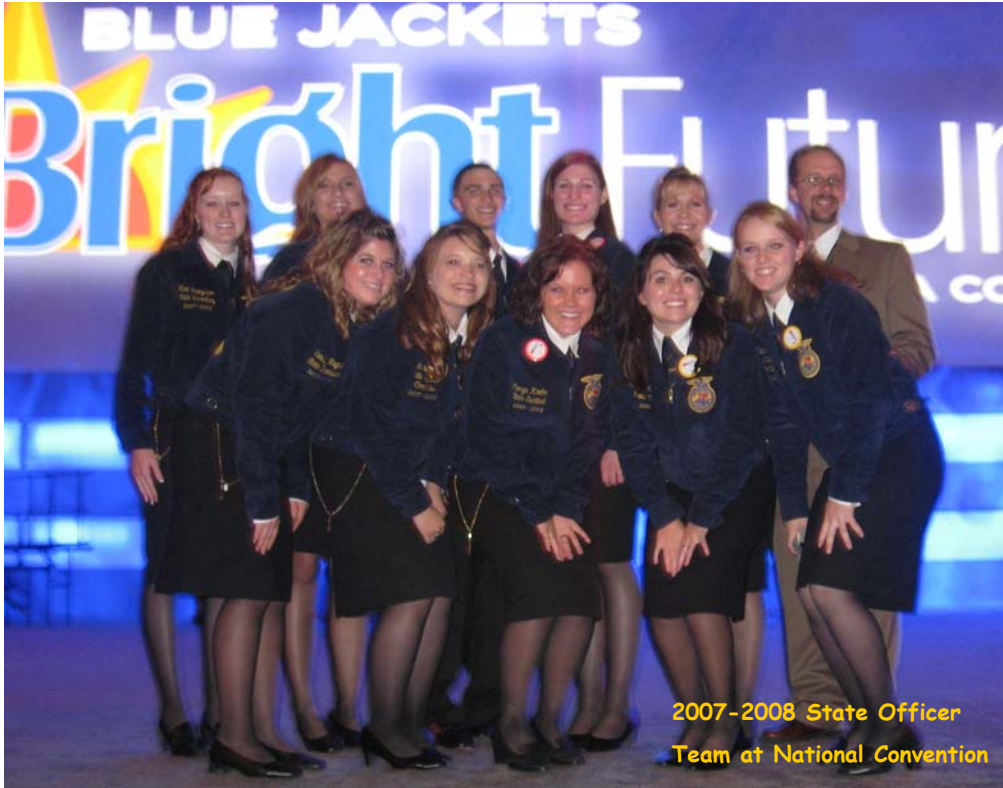
2007-2008 State Officer Team at National Convention

From June to December- Six Months to Remember!